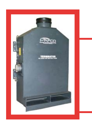
Terminator™ Composite Mesh Pad Exhaust Hoods