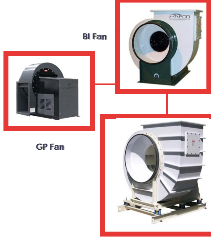
BI Centrifugal Exhaust Fan